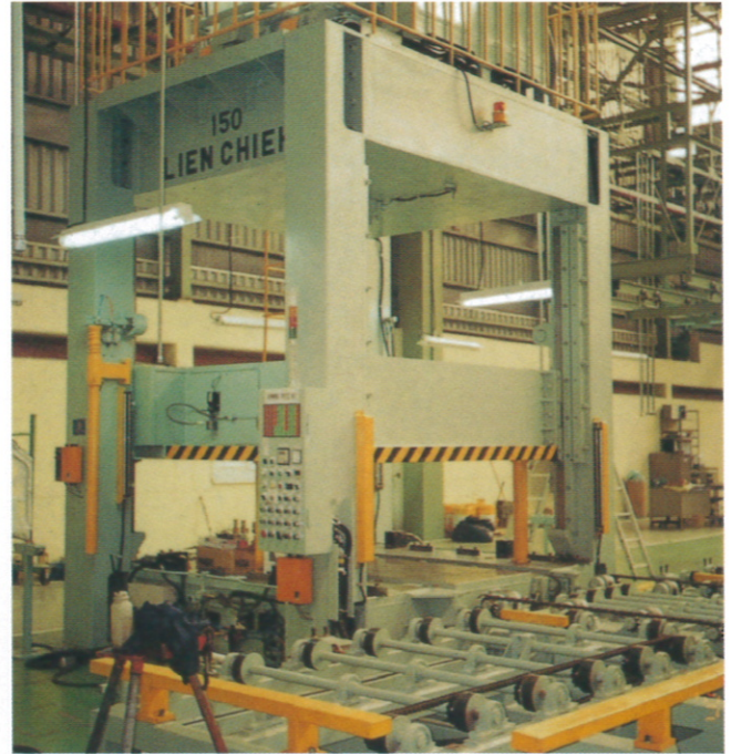
150 TON HEMMING PRESS EQUIPED WITH AUTOMATIC CONVEYOR TOOL CHANGE SYSTEM WITH SEQUENCE CONTROL, INSTALLED IN HONDA FACILITY IN MEXICO FOR CAR BODIES