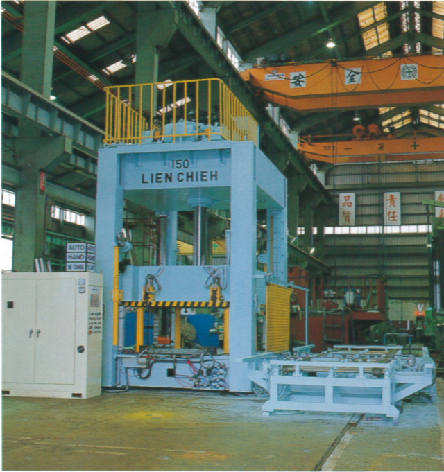
150 TON HEMMING PRESSES EQUIPED WITH AUTOMATIC CONVEYOR TOOL CHANGE SYSTEM WITH SEQUENCE CONTROL, MANUFACTURING CAR BODIES FOR HONDA, FORD, MITSUBISHI-OEM