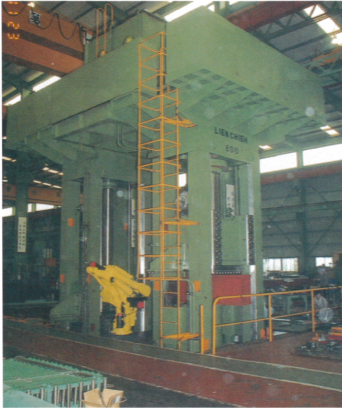
800TON, 300 TON HOT FORGING PRESSES WITH 1,400 HORSEPOWER HYDRAULIC UNIT AND ROBOT FOR LOAD AND EXTRACTION OF PARTS